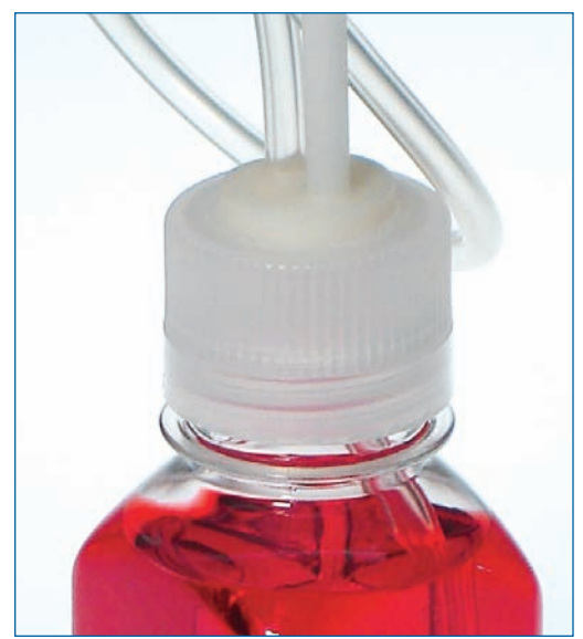
Closeup of a 125mL sterile bottle showing the EZ Top® Closure.