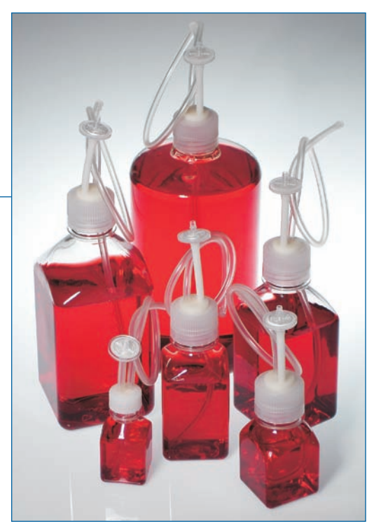
Bio-Simplex™ Sterile Bottle Assembly Systems, in sizes from 6omL to 2 Liters, feature the EZ Top® Closure, filter, C-FLex® tubing, bottle and cap.

For more detailed specs on Bio-Simplex™ Sterile Bottle Assemblies, please see our product spec sheets.