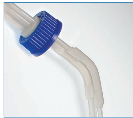
Spinner Flask Closure Assembly and cap. Cap colors may vary.