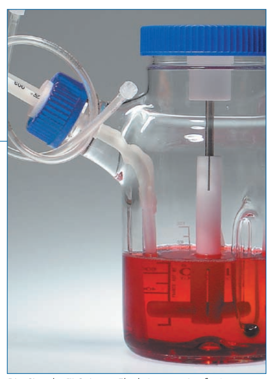
Bio-Simplex™ Spinner Flask Accessories feature the EZ Top® Assembly and cap. Glassware shown is representational of final usage and not included in assembly.

For more detailed specs on Bio-Simplex™ Spinner Flask Accessories, please see our product spec sheets.