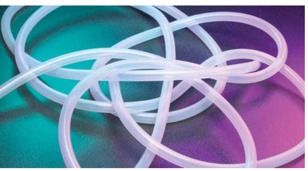
The excellent fatigue resistance properties of TYGON ^{\circ} 3355-L tubing make it an ideal tubing selection for peristaltic pump systems.