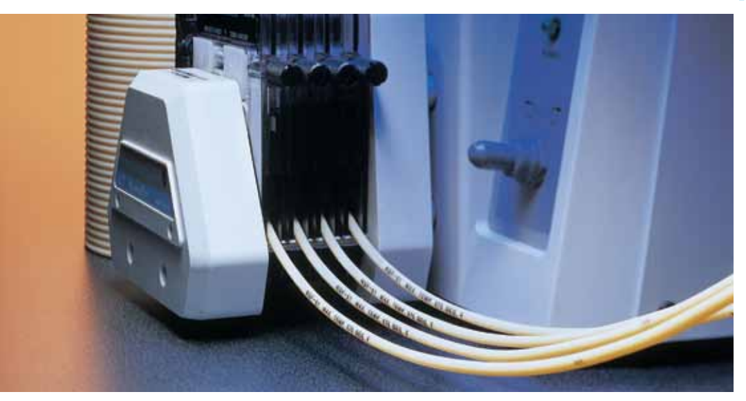
Created with a unique combination of long flex life and biocompatibility, Pharmed® BPT tubing is ideal for life science applications employing peristaltic pumps.