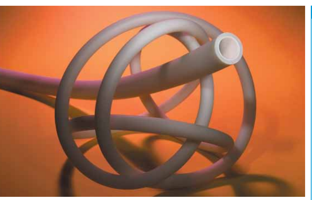
PharmaPure® combines unsurpassed pump life with ultra-low particle spallation, making it the peristaltic pump tubing of choice.